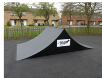
Spine Ramp 1.2m High 2.4m Wide