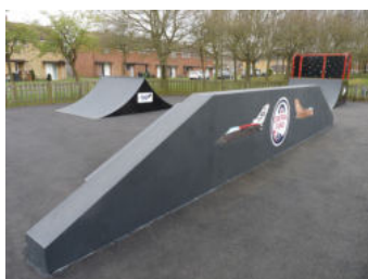
Handrail Box 1.4m High 0.4m Wide 8.6m Long