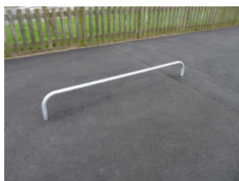
Grind Rail 0.3m High 2.4m Long