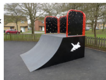
Quarter Pipe 1.2m High 2.4m Wide 3m Long

www.caloo.co.uk 01296 614448 info@caloo.co.uk