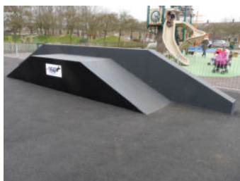
Funbox 0.9m High 1.2m Wide 5.6m Long