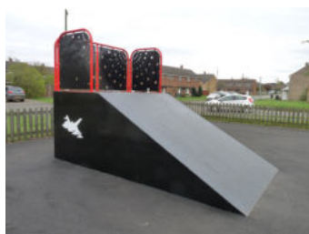
Flatbank 1.5m High 2.4m Wide 4m Long

The riding surface is coated with a specialist protective paint to help deaden sound and is a tough, hard, durable coating used in the automotive industry to protect against stone chips, salt, damp and rust. This provides a great skate surface, is super tough and vandal resistant.